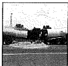
Tanker buckles on Hwy 17 New Today!