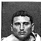
Police ID suspect, officer involved in early-morning shooting