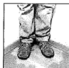
The 9 Most Common Start-up Mistakes 02/8/2012